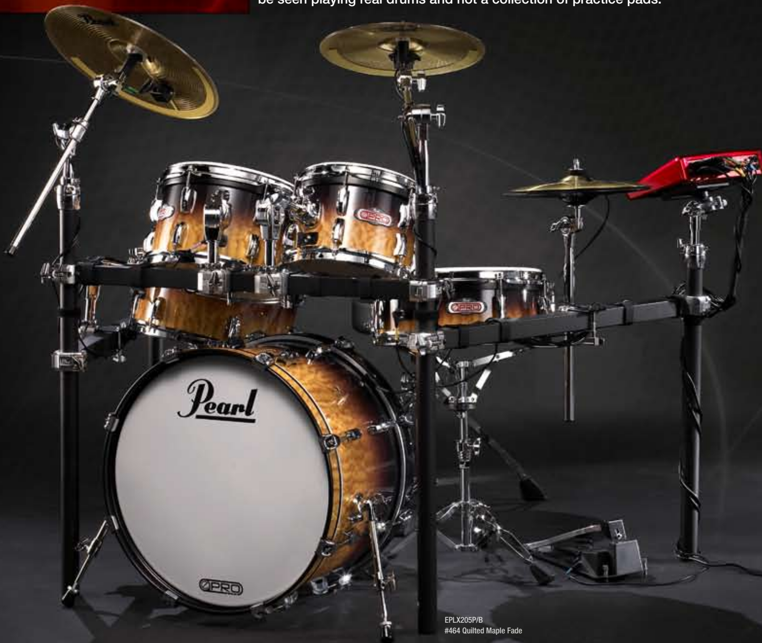
EPLX205P/B #464 Quilted Maple Fade

e-Pro Live looks like real drums because the appearance of your gear is important. It's a statement about who you are as a performer. As drummers we would rather be seen playing real drums and not a collection of practice pads.