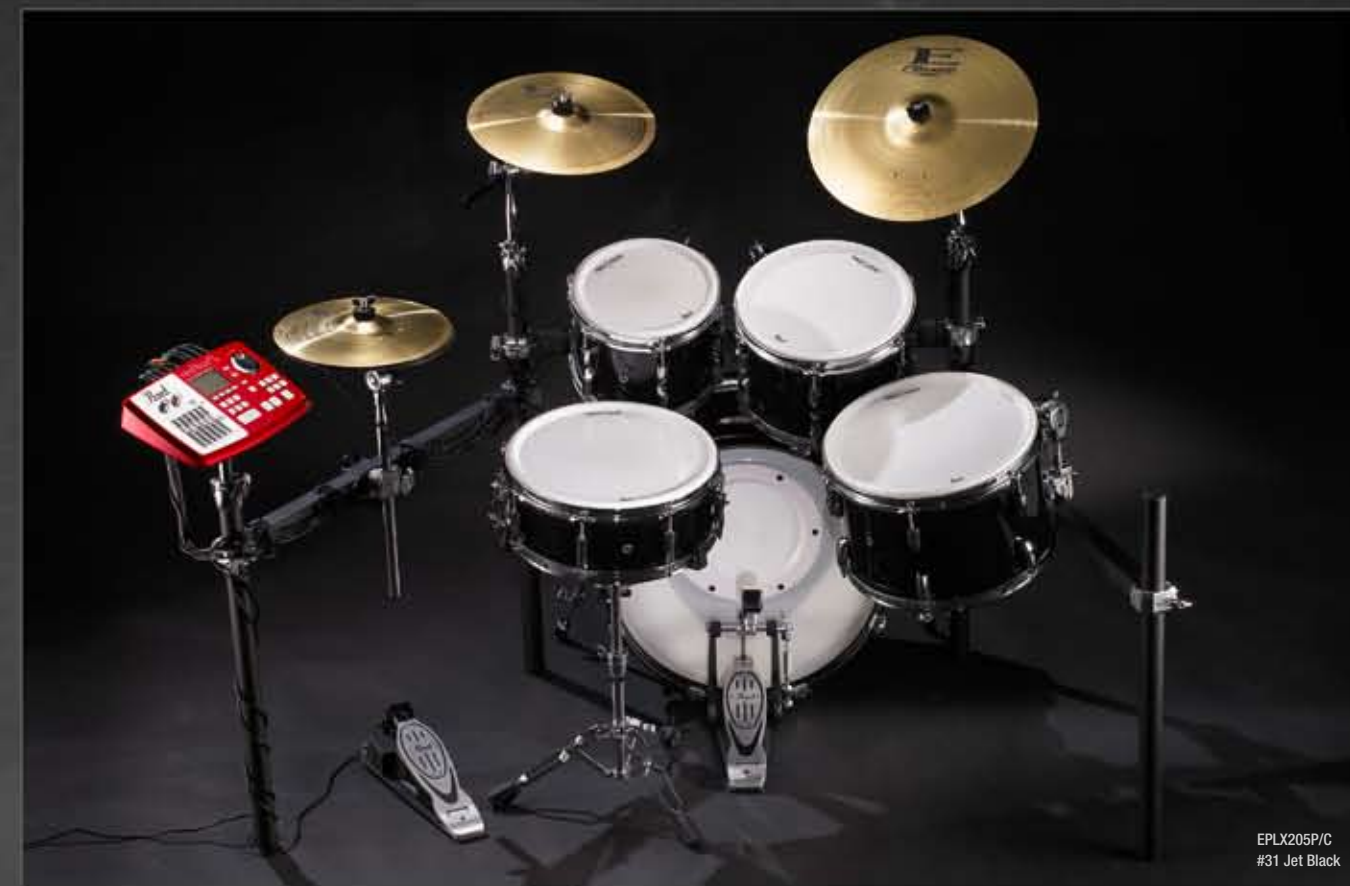
EPLX205P/C #31 Jet Black

Real Feel is the next important ingredient of e-Pro Live. Because, whether you're practicing or performing, we believe playing electronic drums should feel as much like playing acoustic drums as possible. Playing traditional electronic drums with their tightly configured small pads forces you to alter your playing style. e-Pro live drums are sized and configured exactly like acoustic drums for a natural and real feel.